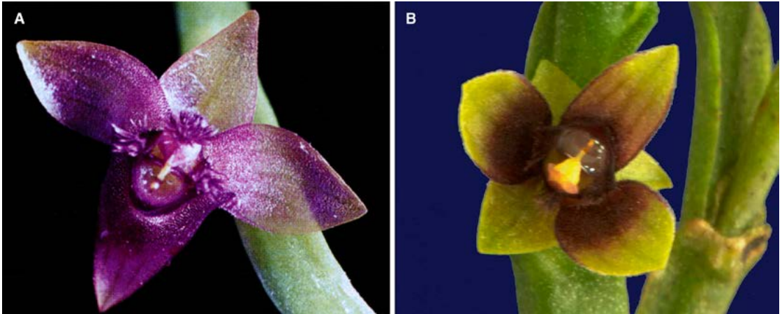
FIGURE 3. Photo of: A — Telipogon amoanus (from Hágsater 4641). B — T. standleyi (from Bogarín 5138). Photographs by E. Hágsater (A) and D. Bogarín (B).

Telipogon amoanus is also similar to Telipogon helleri , which is distinguished by having a fringe of hairs in front of the column and lacking the hairs at the apex of the column (present in T. amoanus and T. standleyi ) (Hamer 1985; Solano et al. 2011).